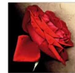
rose 30x30 cm 160 € 1