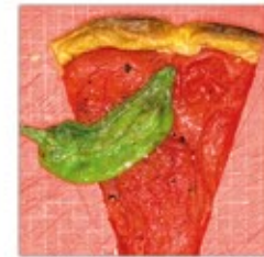
quiche#2 30x30 cm 160 € 1