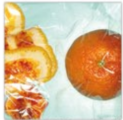
orange#1 30x30 cm 160 € 1