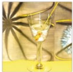
drinks#120 100x100 cm 750 € 1