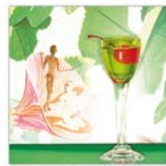
drinks#138 100x100 cm 750 € 1