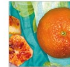
orange#2 30x30 cm 160 € 1