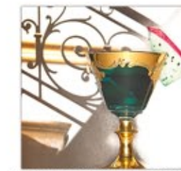
drinks#155 100x100 cm 750 € 1