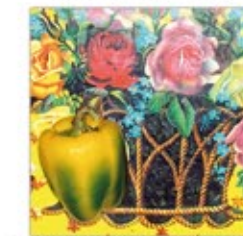
yellow paprika 30x30 cm 160 € 1