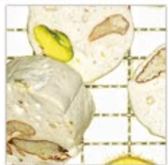
sweet 30x30 cm 160 € 1