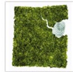
nori 100x100 cm 750 € 2