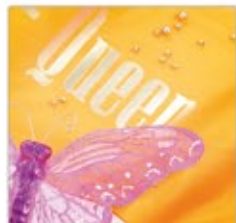
queer 80x80 cm 450 € 2