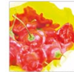
red paprika 30x30 cm 160 € 1