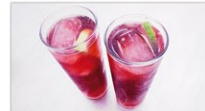
tinto de verano 150x85 cm 750 € 2