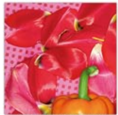
orange paprika 30x30 cm 160 € 1