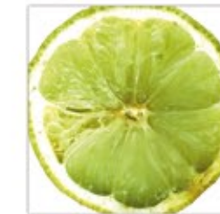
lemon 30x30 cm 160 € 1