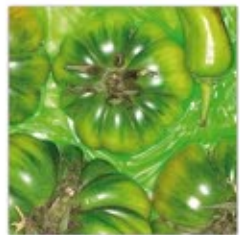
green tomato 30x30 cm 160 € 1