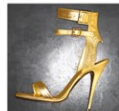
golden shoe 80x80 cm 450 € 2