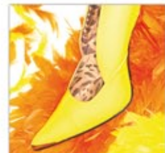
yellow shoe 80x80 cm 450 € 2