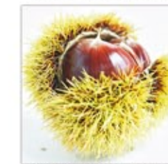
chestnut 30x30 cm 160 € 1