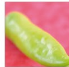
chilli 30x30 cm 160 € 1