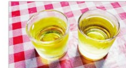
orujo de hierbas 150x85 cm 750 € 2