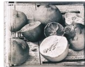
sauer / planet potato 60x75 cm (40x50 cm) 2.000 € / picture incl. Frame 4