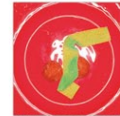
acid drops 30x30 cm 160 € 1