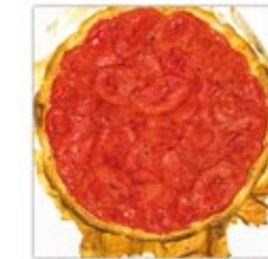
quiche#1 60x60 cm 320 € 1