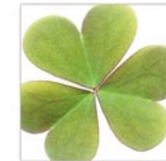
lucky 30x30 cm 160 € 1