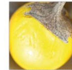
pumpkin#1 60x60 cm 320 € 1