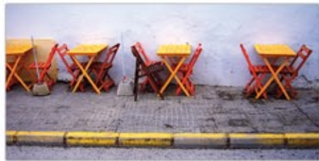
bar 200x100cm 950 € 2