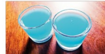
azul 80x45 cm 320 € 2