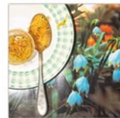
jam 30x30 cm 160 € 1