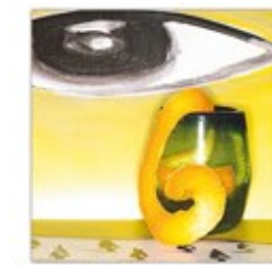
drinks#133 100x100 cm 750 € 1