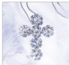
cross 80x80 cm 450 € 2