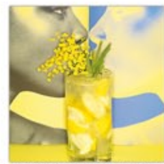
drinks#147 100x100 cm 750 € 1