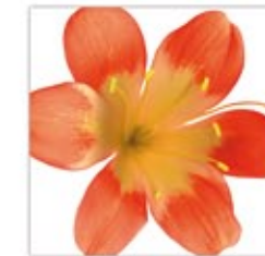
flower 30x30 cm 160 € 1